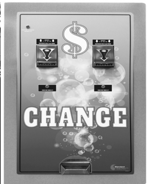
The MC520RL-RHV with interior photo. Shows two 4.6K (4,600 Quarters) Coin Hoppers. Clearance allows full tilt dump operation and still see the LED Display.