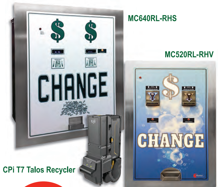
CPi T7 Talos Recycler

The Recyclers are only available on "-DA" (Dual Acceptor) models, due to the limited capacity of the recycler being 25-30 bills - with the concept of customers helping to replenish the capacity throughout your operating hours.