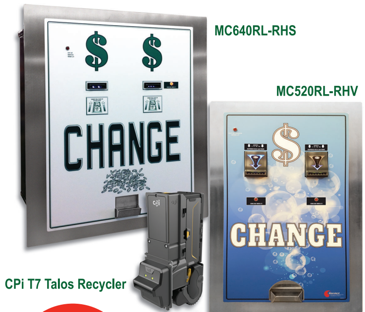
CPi T7 Talos Recycler

The Recyclers are only available on "-DA" (Dual Acceptor) models, due to the limited capacity of the recycler being 25-30 bills - with the concept of customers helping to replenish the capacity throughout your operating hours.