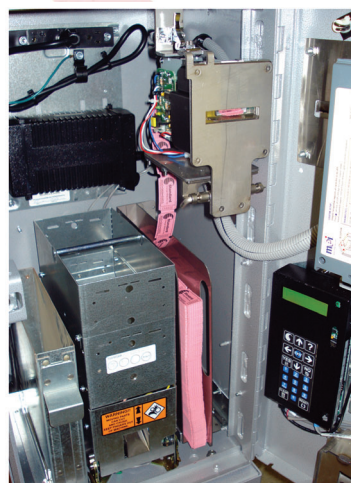
Coin Acceptor Collection Box, Coin Hopper and Ticket Dispenser Cassette installed in the MC200-TIK

Fits exclusively on the MC200-TIK to make it stand out in the crowd. "TICKETS" decals prominent on all four sides - 77" overall height.