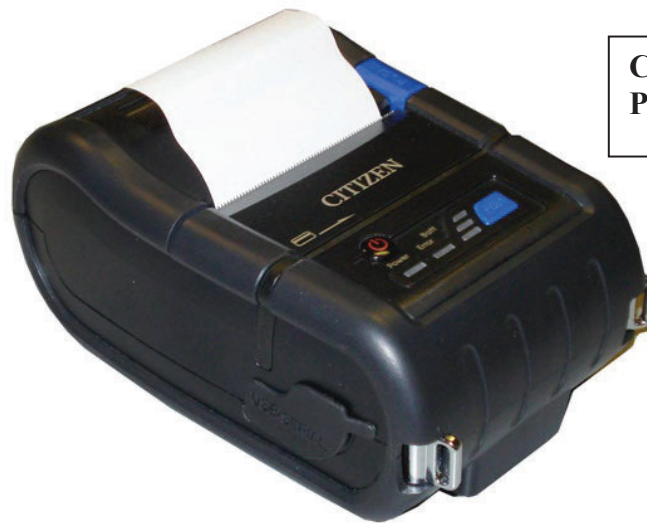
Citizen CMP-20 Portable Audit Printer

The Audit Printer can be used in any machine equipped with an EF Module or EF+ Module . This option allows the variety of Audits and in some machine models, can print the Event or Error logs. Review the machines owner manual for your changer to determine the audits and logs that are available for your specific machine model.